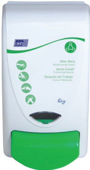
Item # DG5171

After-work medicated conditioning cream is lightly scented, non-greasy, and helps to soothe dry, chapped hands.