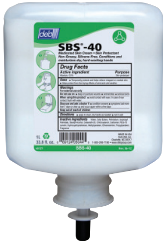
Item # DG6050